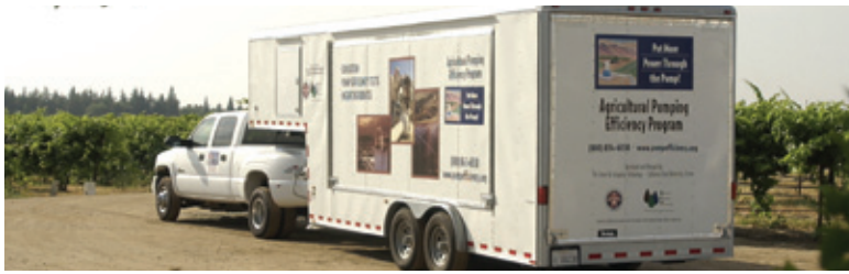
The Mobile Education Center can bring pump education to your event location.