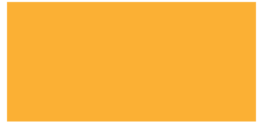
APEP offers technical assistance and hands-on educational seminars.